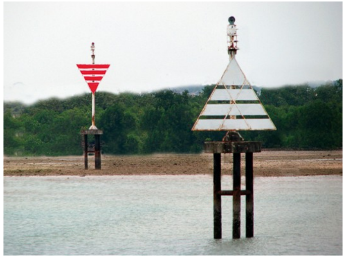
Line up leading marks to enter a harbour

Transits are when two navigation marks line up and give a very accurate position line – just like when you align the front and back sights of a rifle. It's a really simple navigation technique that's been used by sailors for centuries, writes Dick Everitt.